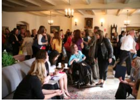
Attendees enjoy conversation and breakfast