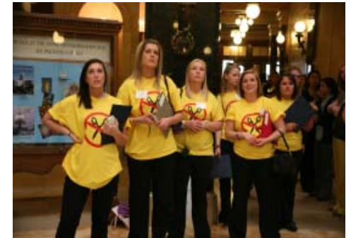
UW Superior students in the Rotunda