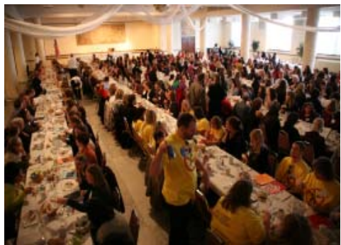
Lunch at the Masonic Center