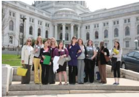
In front of the Capitol