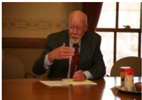
State Senator Fred Risser responds