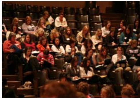
Lobby Day attendees at the keynote address