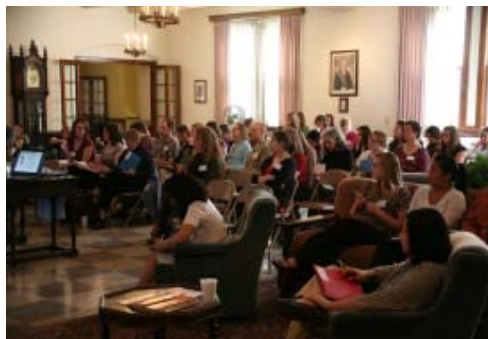
Attendees at School Funding training