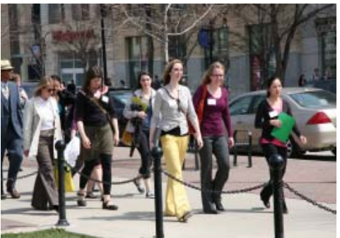
Lobby Day attendees walking to the Capitol