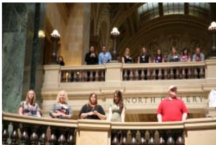
Lobby Day Participants at the Capitol

Over 330 social work practitioners and students from every region of Wisconsin participated in NASW WI's 2011 Lobby Day. For the first time ever, a group of students from the University of Wisconsin - Superior attended. They proudly wore bright yellow tee shirts with a picture of a pair of scissors on the front with a line through it (no cuts!) and stating on the back "Society is judged by how it treats its most vulnerable." There were also large student contingents from UW – Eau Claire, Viterbo University, UW – Whitewater, Carthage College, UW- Oshkosh, UW – Madison, Edgewood College and George Williams College. Approximately 20% of this year's attendees were practicing social workers from a wide range of agencies and organizations.