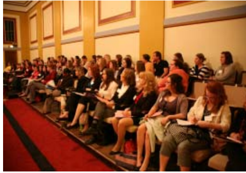
Attendees at the Child Victims Act Training