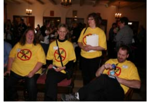
UW Superior Students in their "No Cuts" tee shirts